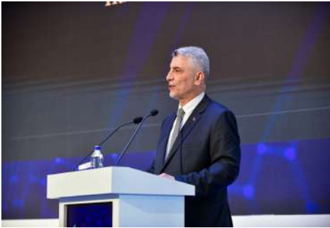
H.E. Prof. Dr. Ömer Bolat, Minister of Trade, Republic of Türkiye