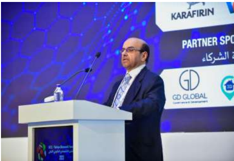
H.E. Dr. Saad Albarak, Deputy Prime Minister and Minister of Oil and Minister of State for Economic and Investment Affairs, State of Kuwait

A signing ceremony of MOUs between Saudi and Turkish companies underscored the tangible commitment to economic collaboration forged during the forum.