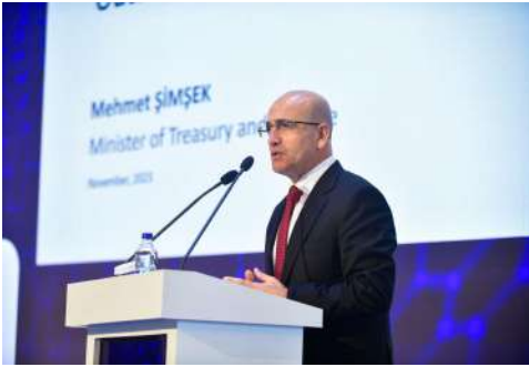
H.E. Mr. Mehmet Şimşek, Minister of Treasury and Finance, Republic of Türkiye